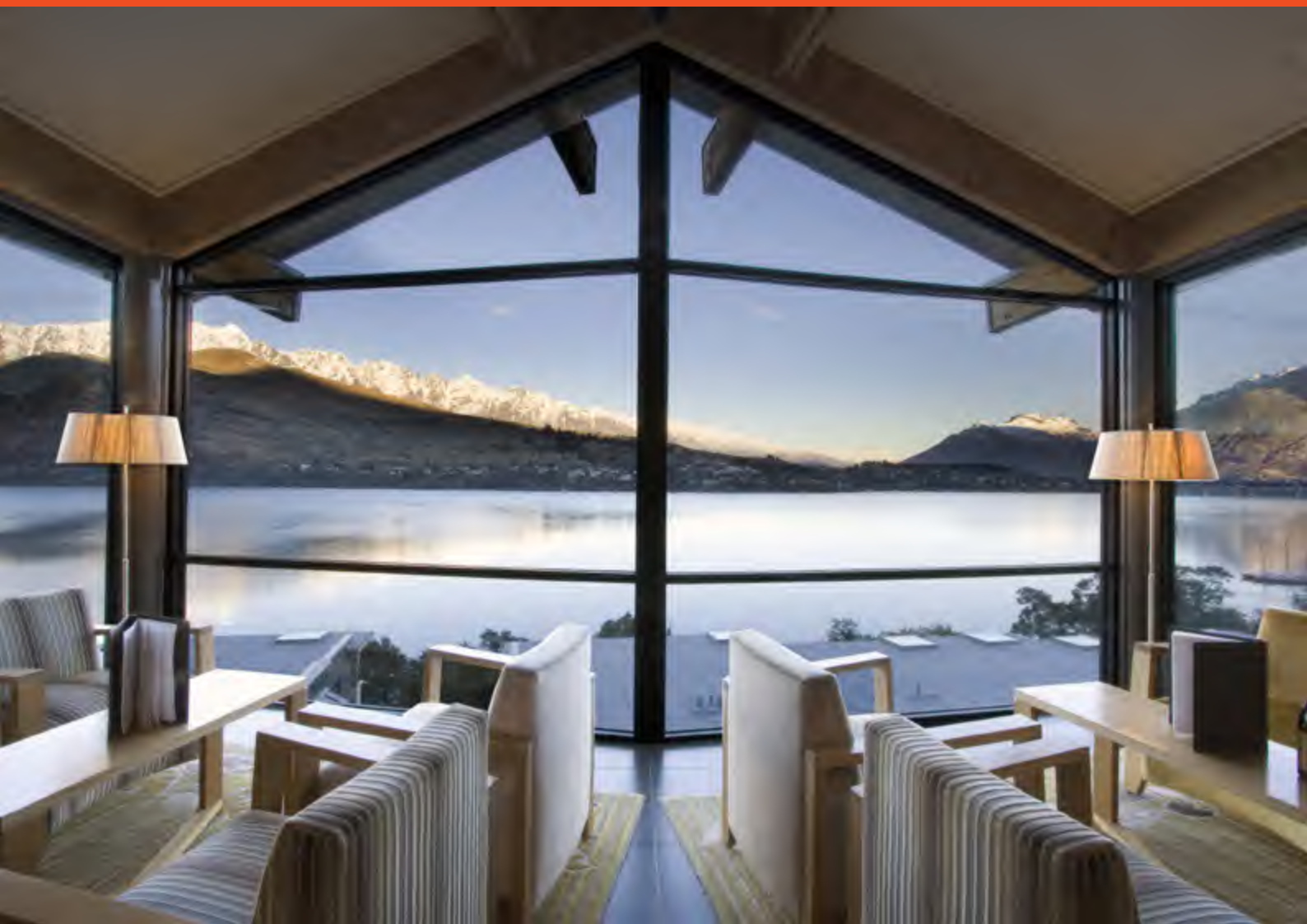
The Rees Hotel, Queenstown