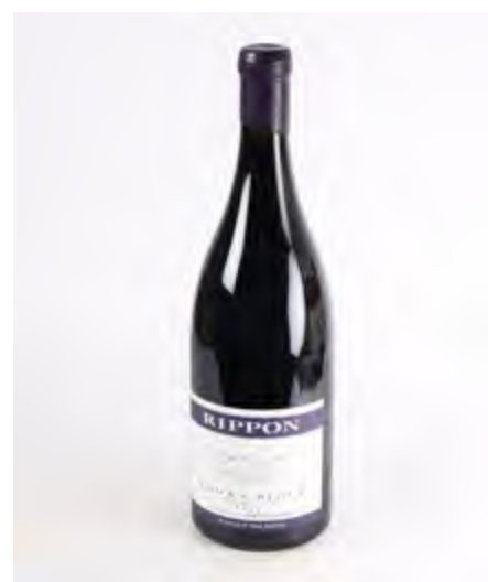
Lot 80: (1) 2010 Rippon Emma's Block Pinot Noir 3000ml, Wanaka RP92+ $800—$900