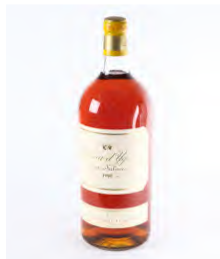
Lot 304: (1) 1990 Chateau d'Yquem 5000ml (OWC) RP98 $5,500—$6,500

299. (1) 2012 Domaine Francois Raveneau Foret 1er Cru, Chablis BH90 $500—$700