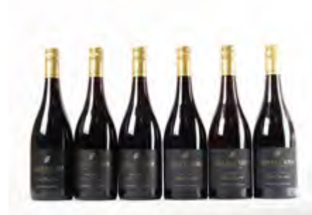
Lot 66: (1) Quartz Reef Bendigo Single Ferment Pinot Noir Vertical : 2014 - 2019 inclusive (6 pack) (SC) (GB) $500—$600

82. (4) 2014 Bell Hill Old Weka Pass Pinot Noir, Waikari (SC) $110—$130